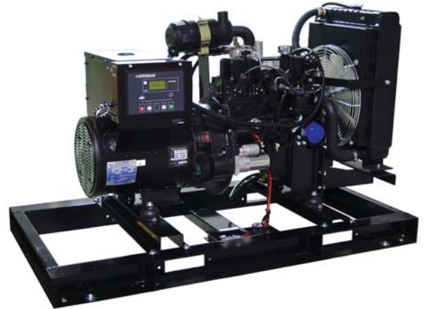
SHOWN IS MODEL SP-300, 30 KW GENERATOR SET.