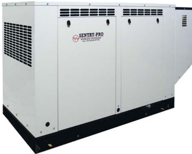
SHOWN IS MODEL SP-300, 30 KW GENERATOR SET.