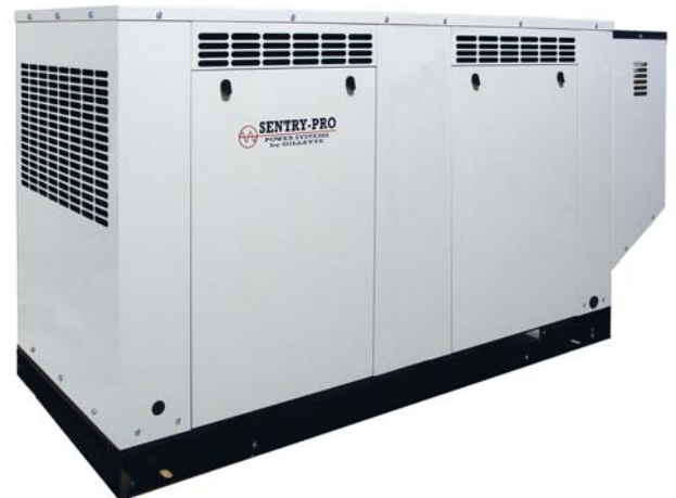
SHOWN IS MODEL SPJD-1000, 100 KW GENERATOR SET.